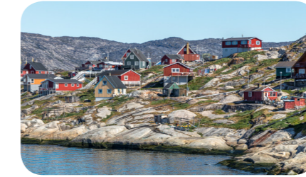
Summer in Greenland

The Arctic region has cold winters and cool summers. The winter season falls between November and March and during this time, the days are short. The summer season falls between April and October. The days are long, with periods of continuous daylight.