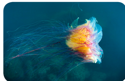
lion's mane jellyfish

There are more fish species in the Arctic Ocean than anywhere else in the world, including salmon, cod and Greenland sharks. Other aquatic species include jellyfish, whales, seals and walruses.