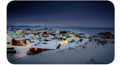
Winter in Greenland

The average temperature in the Arctic ranges from -43^{\circ}\text{C} to 13^{\circ}\text{C} . This range in temperature depends on the season and location.