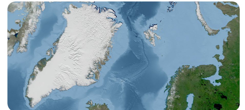
Satellite view of Greenland

Greenland experiences the coldest climate in the Arctic region. The temperatures of the coastal areas around Greenland are affected by the open water, sea ice or passing cyclones. However, since almost 80% of Greenland is covered by an ice sheet, the centre of the country remains cold. Winter temperatures can drop as low as -50^{\circ}\text{C} . Summer temperatures can reach 10^{\circ}\text{C} .