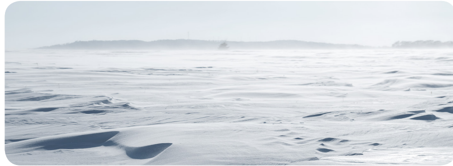
Desert region in the Arctic Basin

Most areas within the Arctic region receive less than 500mm of precipitation per year, the majority of this falling as snow. The Arctic Basin can be classified as a desert region because it receives less than 250mm of precipitation per year. There can also be strong winds, including cyclones, in parts of the Arctic.