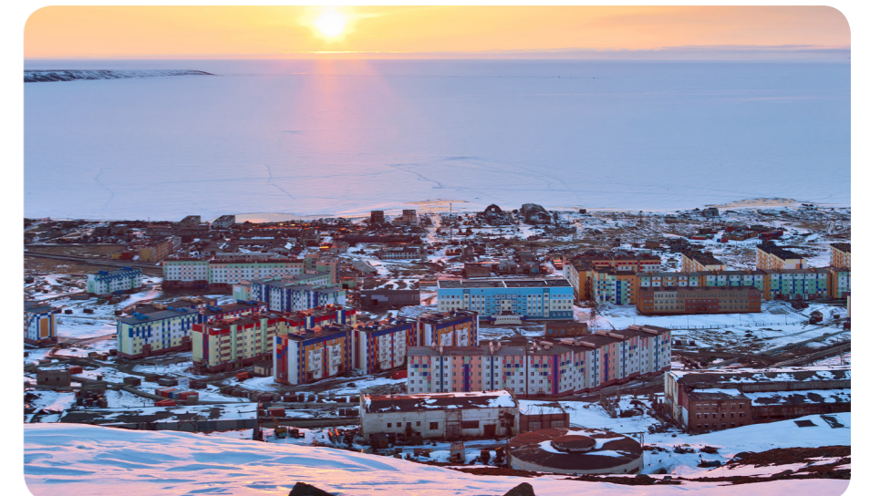
Modern town in Russia

In the Arctic, there are villages, towns and cities. There are modern cities, with access to technology, such as the internet. There are also more traditional settlements, without modern facilities.