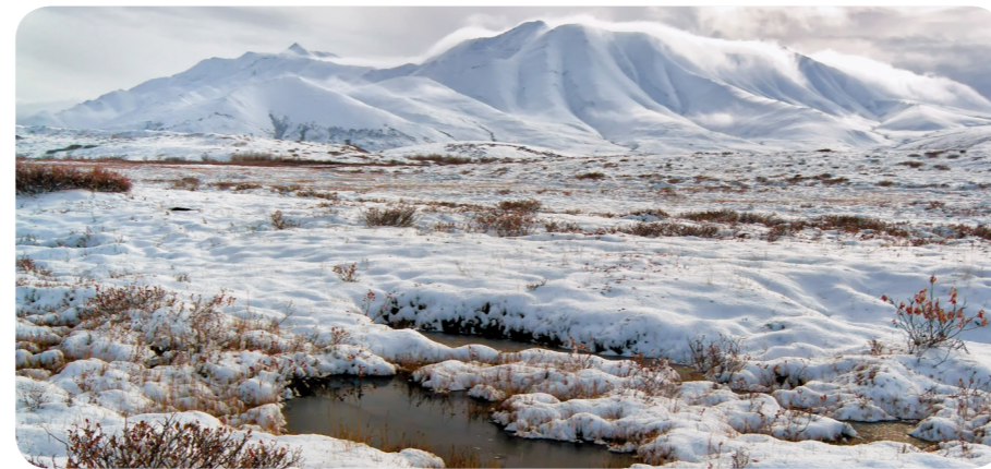
Pools of tundra water beginning to freeze for the winter in Alaska

The land around the Arctic Ocean is predominantly tundra. This is land where trees struggle to grow, due to the low temperatures, frozen ground and short growing seasons. Much of the land is covered in permafrost, which means the ground is permanently frozen. Only low-growing plants, such as mosses and grasses can grow in these conditions. When the top layer of permafrost melts in summer, the land turns to marshes, lakes, bogs and streams as the water cannot sink below the deeper frozen ground.