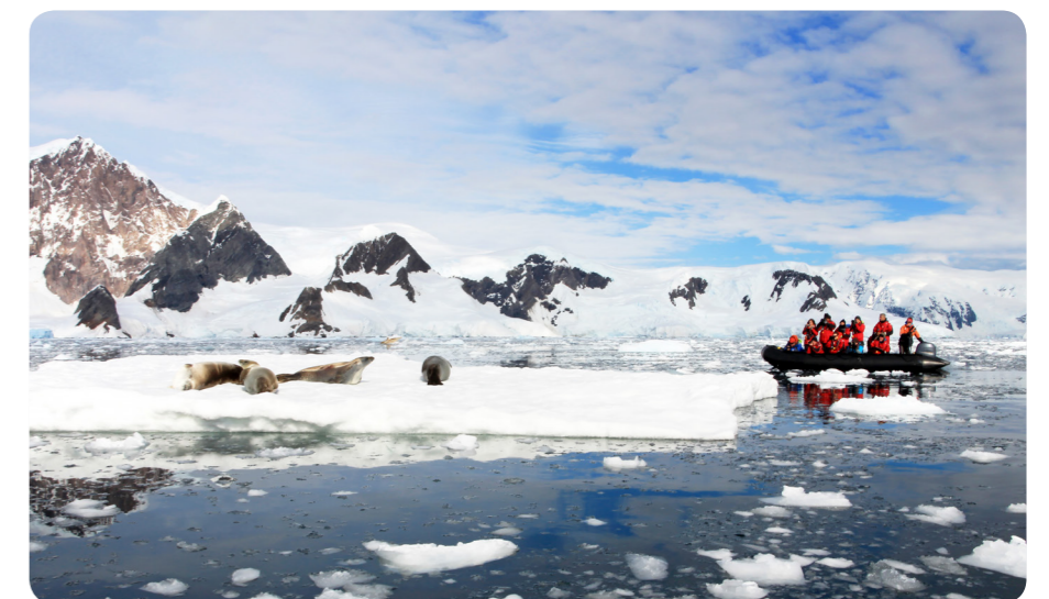
Tourists observing seals on Antarctica

Many countries have tried to claim ownership of Antarctica but the Antarctic Treaty made the continent a protected natural reserve that is dedicated to science and peace. The only people who visit Antarctica are scientific researchers or tourists. Even the scientific researchers only stay on Antarctica for a short time of between three and fifteen months, mainly in summer.