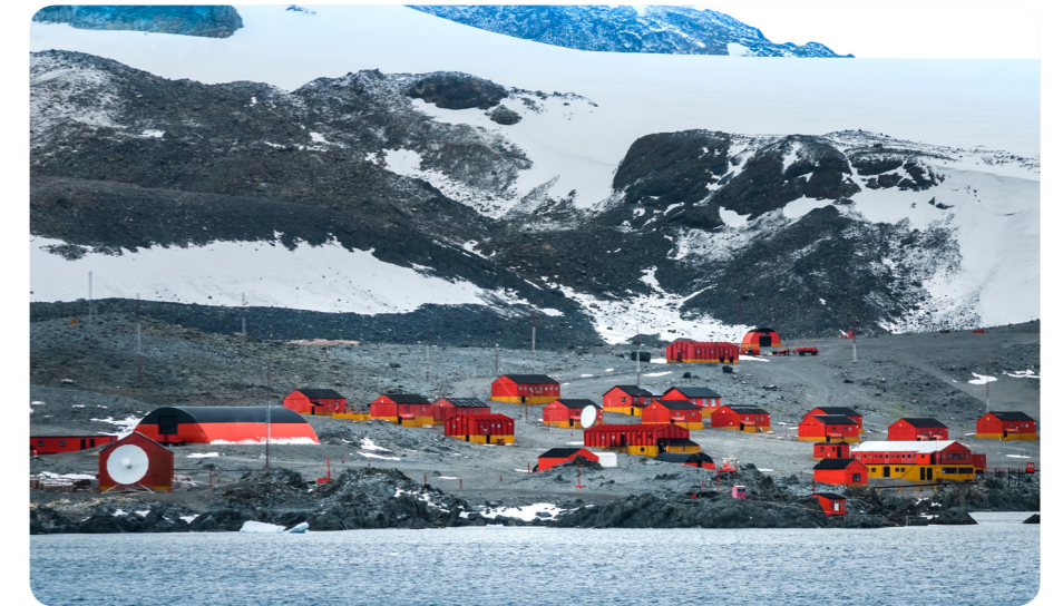
Research station in Antarctica

Throughout the 1800s and early 1900s, seal and whaling stations were established on the continent. Explorers fought their way to reach the South Pole, with the Norwegian Roald Amundsen being the first to reach it in 1911, closely followed by the British explorer Robert Falcon Scott.