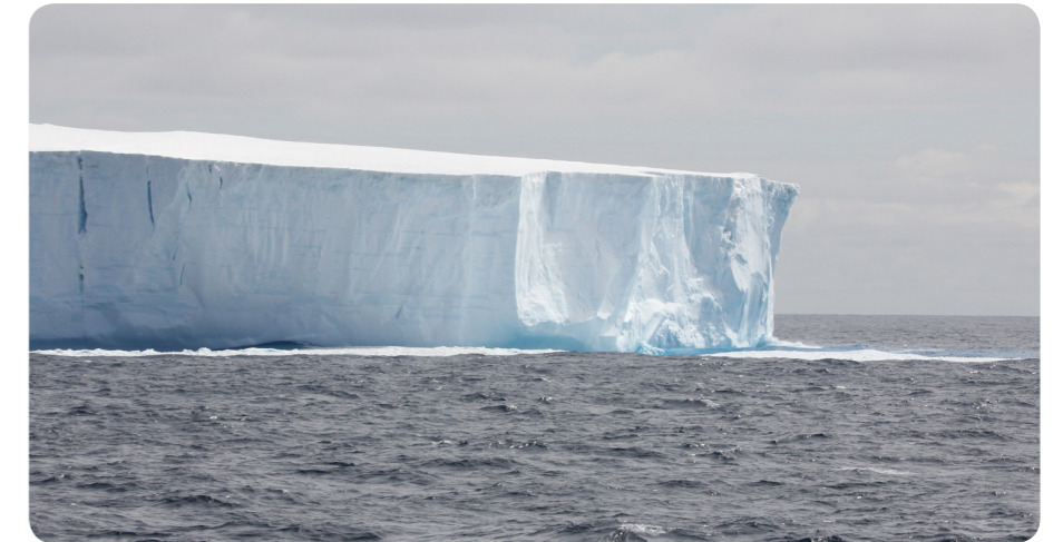
Ross Ice Shelf

The largest ice shelf is the Ross Ice Shelf, which is approximately the size of France. Icebergs are created when pieces of ice break off an ice shelf. In winter, the sea around Antarctica freezes as sea ice. This causes the continent to almost double in size.