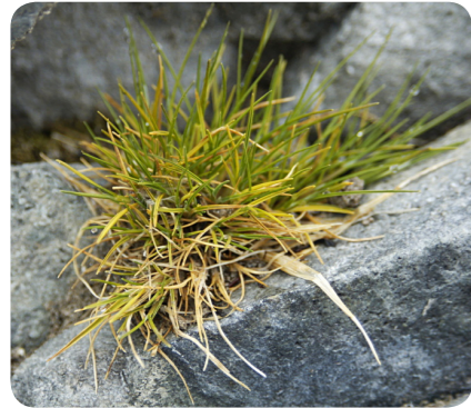
Antarctic hair grass

The landscape of Antarctica has limited vegetation. As the continent is covered in ice and snow for most of the year, few plants have adapted to these harsh conditions. No trees or shrubs are found on Antarctica and there are only two species of flowering plant found in the region. These are Antarctic hair grass and Antarctic pearlwort.