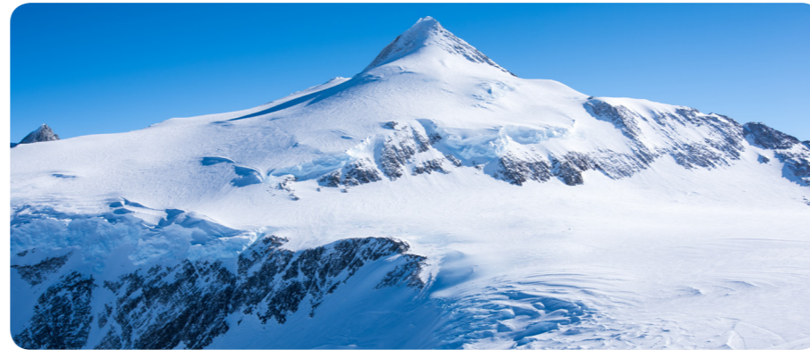
Vinson Massif, Transantarctic Mountains

Antarctica has two main regions: East and West Antarctica. The two regions are divided by the Transantarctic Mountains, which stretch 3540km. Vinson Massif is the highest point, at 4892m above sea level. As the highest continent on Earth, Antarctica's average altitude reaches approximately 2300m above sea level. The bottom of the ice shelves attached to Antarctica can be 2500m below sea level.