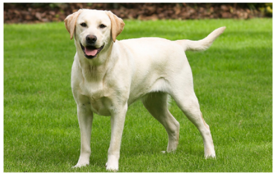
Parent dog: Labrador