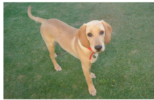
Mixed-breed dog: Spanador